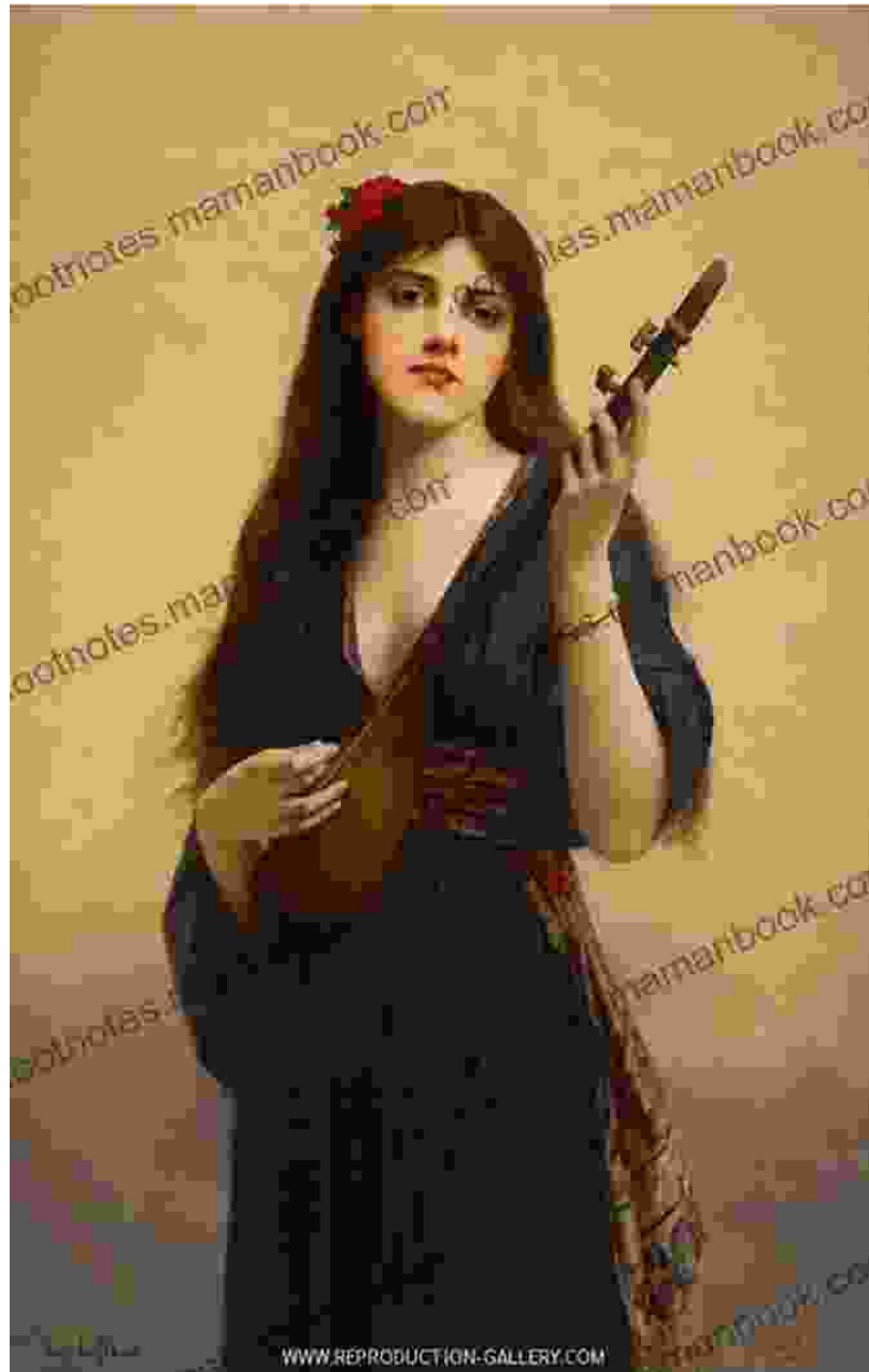
A song mistress from the Middle Ages