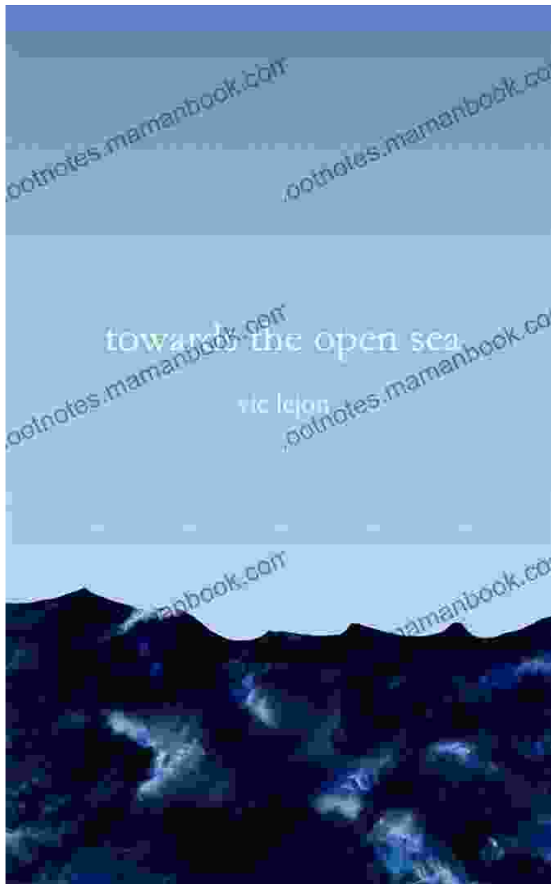
Vic Lejon, Calm Sea, 2010